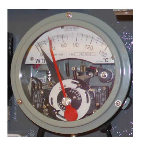
Winding Temperature guage (WT) - Figure 7.