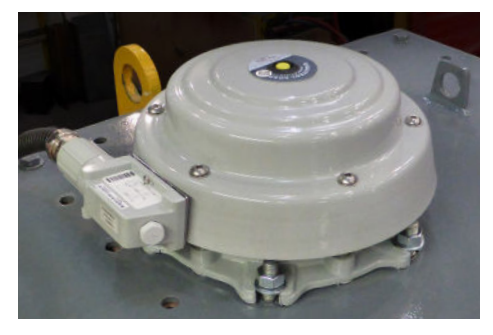
Pressure relief device.