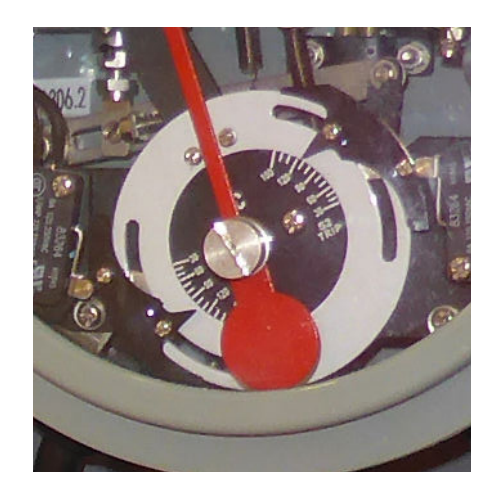
WTI Close up - showing alarm / trip - Figure 7a.